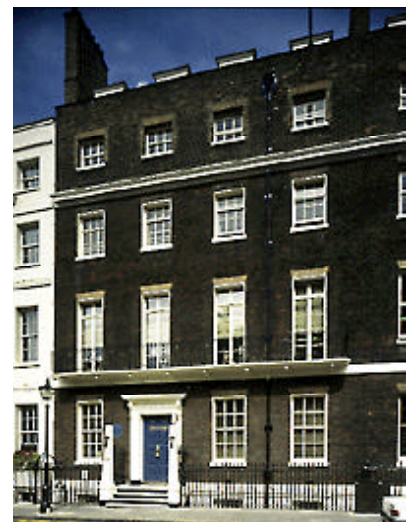
Chatham House, London